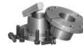
TWIN TAPER BRUSHING KIT