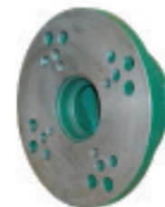
CEMA ADAPTER FLANGE