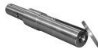
CEMA DRIVE SHAFT